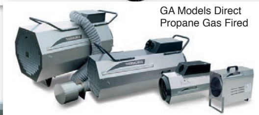
GA Models Direct Propane Gas Fired