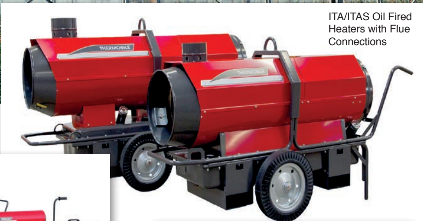
ITA/ITAS Oil Fired Heaters with Flue Connections