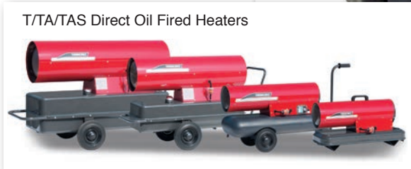
T/TA/TAS Direct Oil Fired Heaters